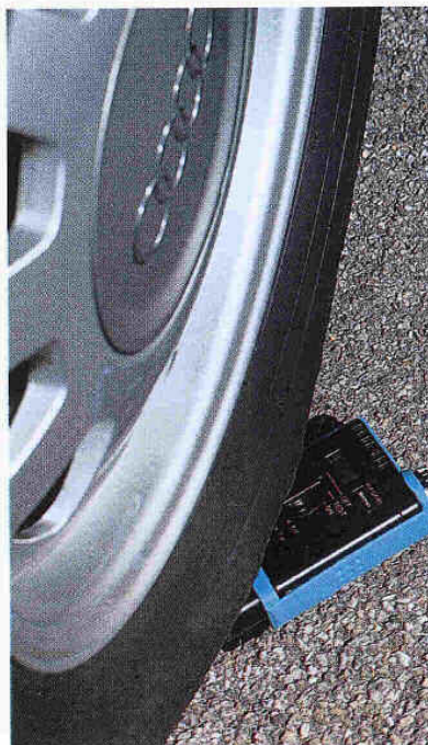
The ABS-housing can take a lot of stress.