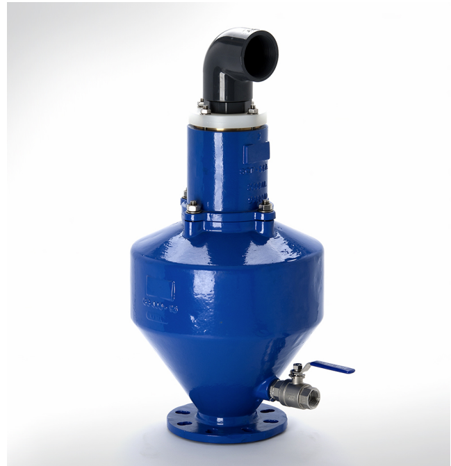
Air Flow Rate [m 3 /h] at 0°C, 1013 mbar, Nominal Pressure PN for standard design

Operating instructions, know how and safety instructions must be observed. The pressure has always been indicated as overpressure. We reserve the right to alter technical specifications without notice.